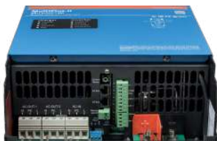
Connection Area MultiPlus-II 3k